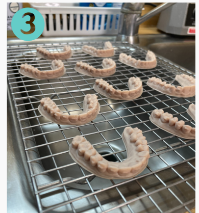
3 Models for retainer and aligner fabrication are printed, washed/rinsed in IPA, rinsed with water, and are placed here to dry.