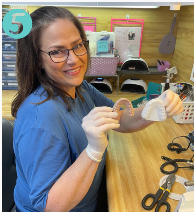
5 Undercuts are blocked out and the Biostar is used to vacuum-form the thermoplastic material onto the model.