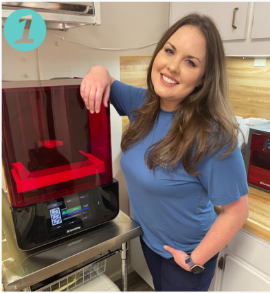
1 An intraoral scan is taken first. The aligner plan is then fabricated and approved by the doctor. Our 3D SprintRay Printer is pictured here!