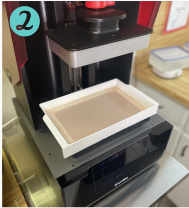
2 Resin is poured and the printer is ready to go!