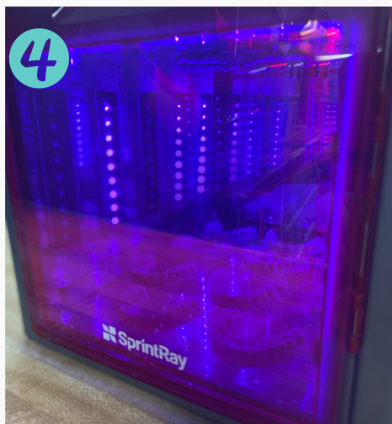
4 Models are cured for ~15 minutes.