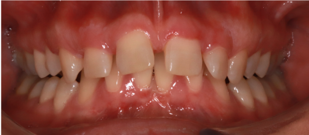
Spacing and Class II correction