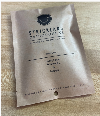
This is the packaging we use to give our patients their aligners and retainers. They always get their 3D printed resin models to have in case of any replacement needs!