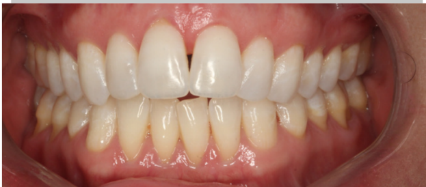
Open bite with black triangle