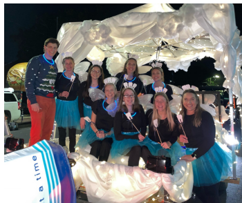
Fairhope Christmas Parade

Congrats to Malbis Parkway Pediatric Dentistry for winning our pumpkin decorating contest! We'd also like to thank all of the offices that participated. We had some really cute entries!