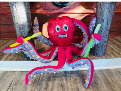
Pumpkin Decorating Contest

Congrats to Malbis Parkway Pediatric Dentistry for winning our pumpkin decorating contest! We'd also like to thank all of the offices that participated. We had some really cute entries!